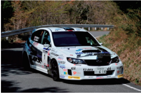
Fig. 3 Japanese Rally Championship: Subaru Impreza WRX STI Spec C (4)