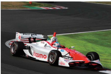
Fig. 2 Formula Nippon: Team Dandelion Racing (3)

Formula Nippon races became all the same length of 250 km. Although obligatory tire changes and refueling were abolished, the fuel tank volume was adjusted so that cars cannot run a full race without at least one pit stop as a measure to encourage exciting racing.