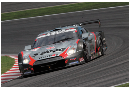
Fig. 1 Super GT: Nissan GT-R (2)