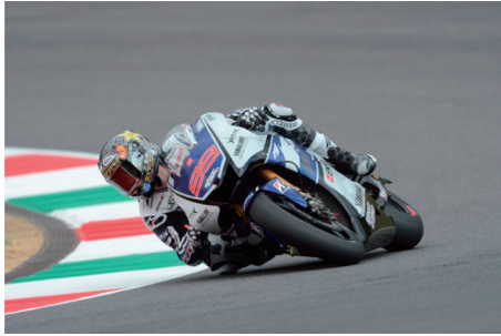
Fig. 5 MotoGP: Yamaha YZR-M1 (6)

like, MotoGP found an optimum performance balance between both types of bikes, reduced costs, and helped to vitalize the racing.