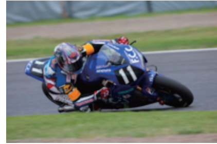
Fig. 6 Suzuka 8 Hours Endurance Road Race: Honda CBR1000RR (7)

The smallest displacement class in the Road Racing World Championship Grand Prix is Moto3, which has adopted 4-stroke 250 cc engines in 2012 instead of 2-stroke 125 cc engines. This class features both dedicated manufacturer-produced bikes and bikes using manufacturer-supplied engines. Various innovations have been implemented to reduce costs. The sales price of an engine has been limited to 12,000 euros and manufacturers are obligated to supply engines to up to 15 riders. Engine speeds are limited to 14,000 rpm and the development of electronic controls has been restricted by the use of a common engine control unit. Close to 35 bikes entered the series from 2012, which was the first year of the new regulations. It is hoped that this class will develop even further in the future,