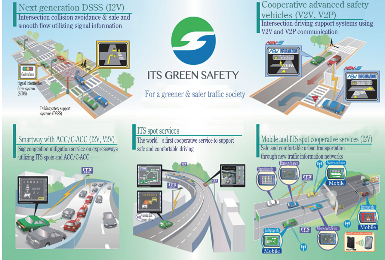
Fig. 3 ITS Green Showcase.

In addition, at the 2013 ITS World Congress in Tokyo, the ITS Green Safety Showcase, an initiative to resolve traffic problems through cooperative ITS, carried out the following three activities (Fig. 3).