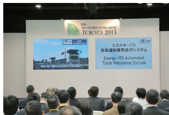
Fig. 4 Live broadcast of vehicle platoon driving showcase.

To introduce the methods and technology to quan-